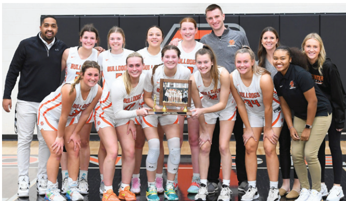
Girls Basketball District Champions