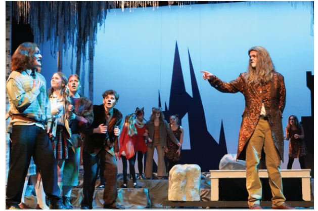
Fall Play: The Lion, The Witch and the Wardrobe

Sold out three of the four shows, with 2,745 tickets sold, an all-time high number of tickets sold for BCHS Theatre!