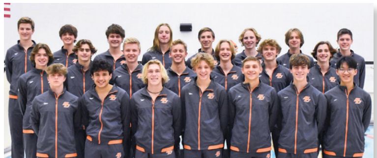
Boys Swim/Dive placed 8th in the State Finals