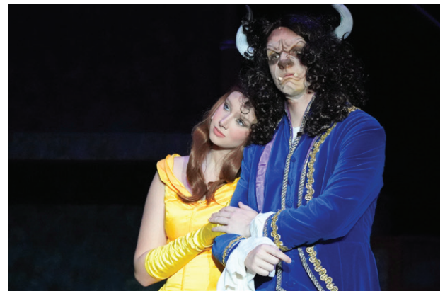
Spring Musical: Beauty and the Beast