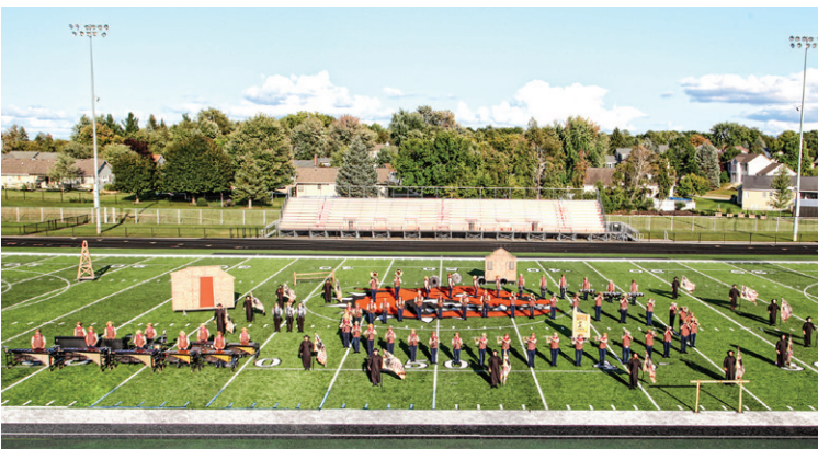
Official photo of the BCHS Marching Band

State Solo and Ensemble: 23 First Division ratings and Seven Second Division ratings