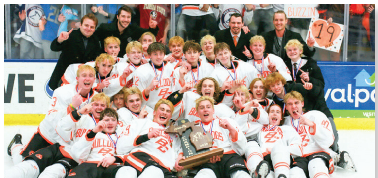
Hockey D2 State Champions