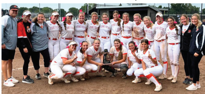
Softball District Champions, 10x Conference Champs