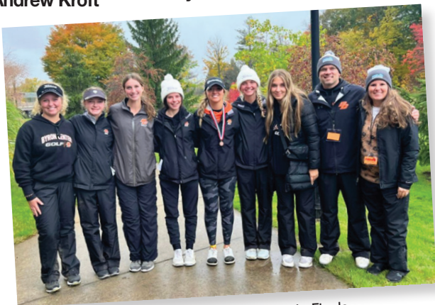
Girls Golf placed 9th in the State Finals