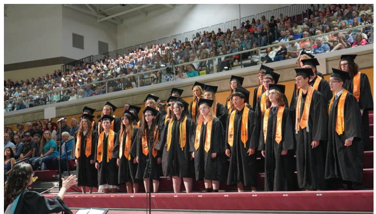
Vocal Expressions sings the Class of 2024's song, Home by Phillip Phillips at graduation