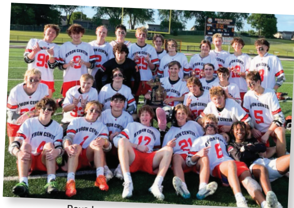
Boys Lacrosse Regional Champions