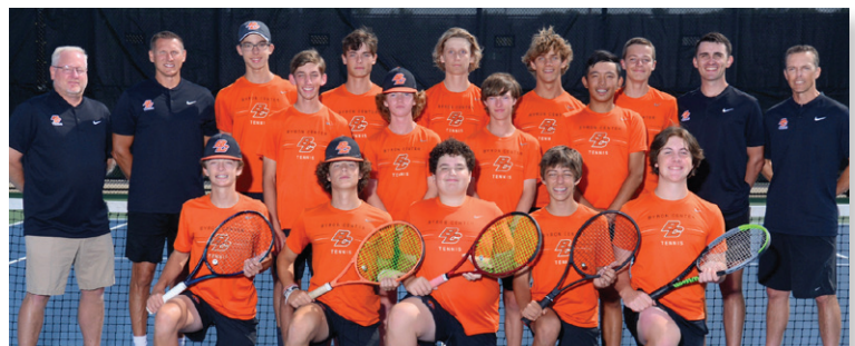
Boys Tennis placed 7th in the State Finals