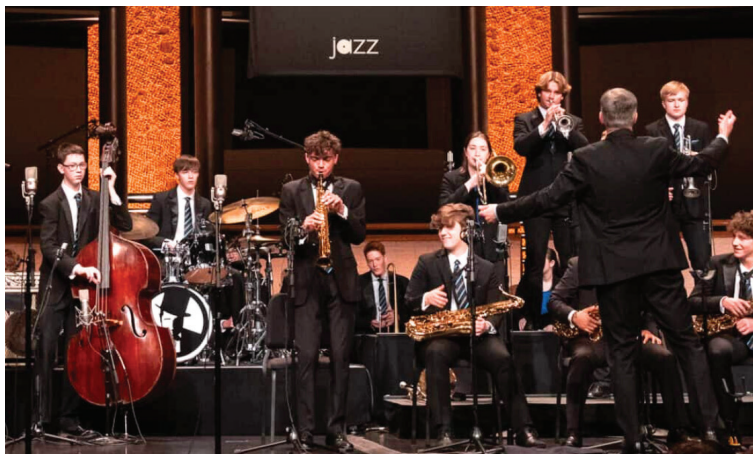
Jazz Orchestra performs at Essentially Ellington in New York City