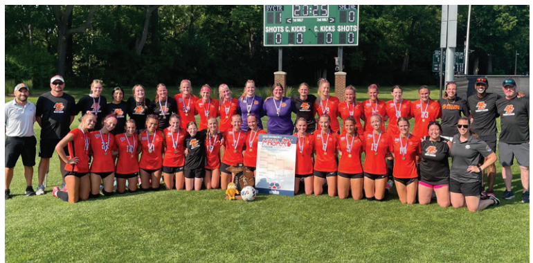
Girls Soccer Division 1 State Champions!