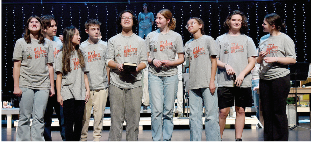
The cast of It's a Wonderful Life: A Live Radio Play is pictured.