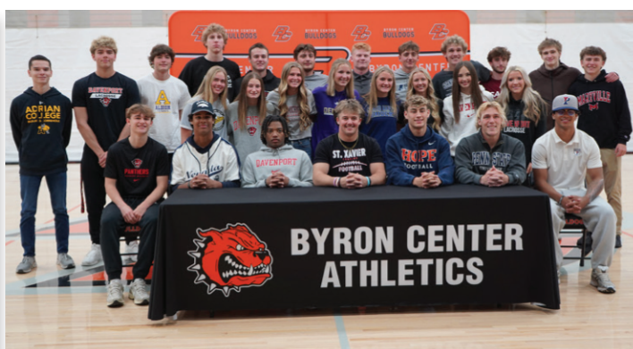
The BCHS Class of 2025 student-athletes pictured on signing day