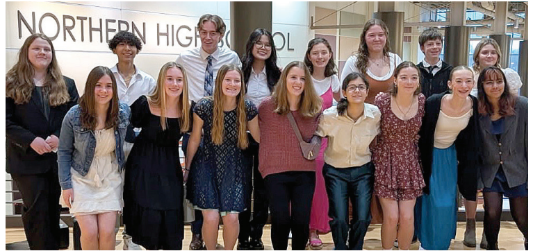
Byron Center High School's Clarinet Choir was named on of the top Chamber Ensembles in the state at State Solo & Ensemble.