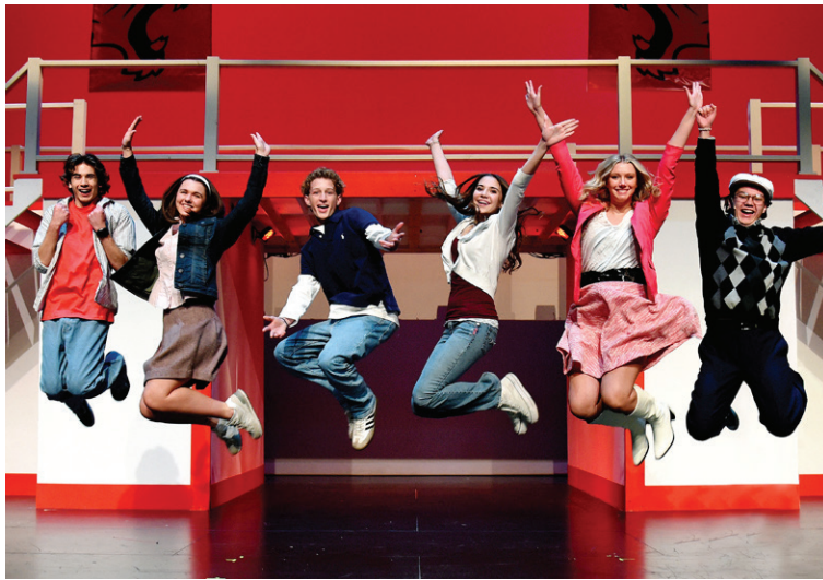
The lead characters of the spring musical, High School Musical On Stage!, are pictured.