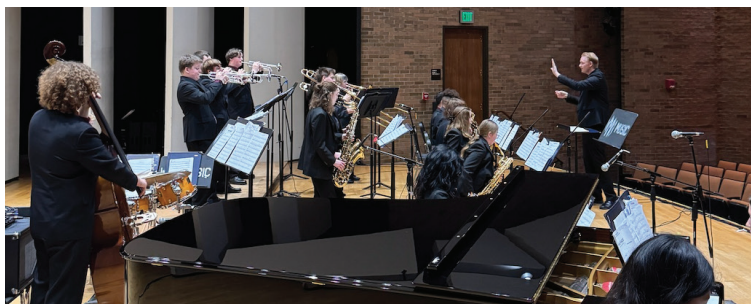
BCHS' Jazz Band performs at the Western Michigan University Jazz Festival.