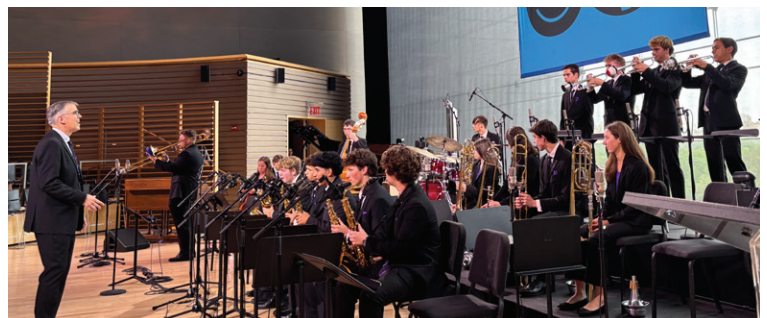
Byron Center's Jazz Orchestra performs at the 30th Anniversary of Essentially Ellington in New York City.

District Choral Festival: Intermediate Choir & Vocal Expressions received a first division rating. Bella Voce got a first division rating & perfect score!