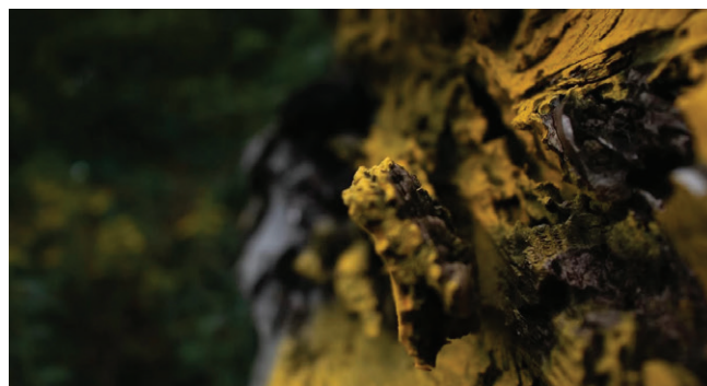
Scholastic Gold Key Finite , Kayleigh Imperi