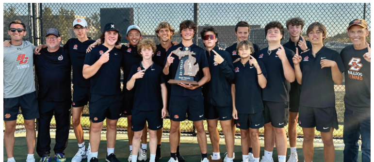
Boys Tennis placed 4th in the Division 2 State Final