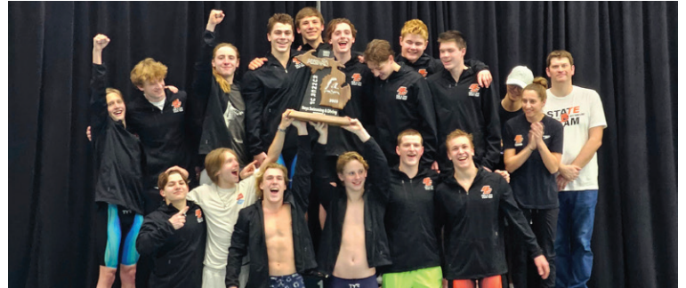
Boys Swim/Dive Conference Champs & Division 2 State Runner-Up