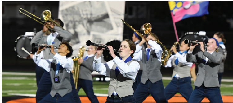
Byron Center High School's marching band performs at a Friday night football game.