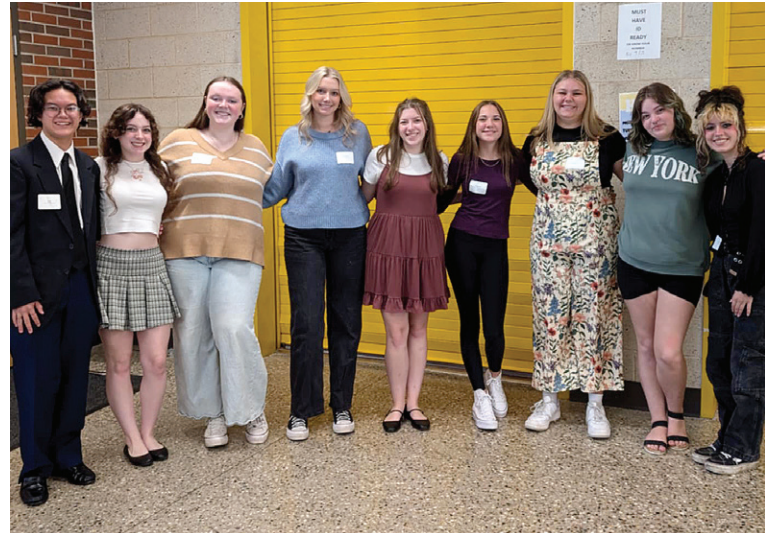
These nine BCHS students auditioned for Musical Theatre Intensive and were selected to learn and study with some of the best names in the musical theatre world.

The musical was based on the Disney Channel Original Movie, showcasing all the fan favorite characters. Students had the chance to perform multiple shows for community members over two weekends!