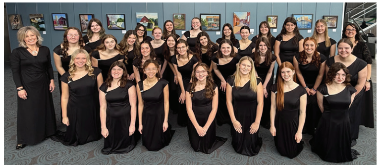
Byron Center High School's Bella Voce choir received a perfect score at the District Choral Festival.