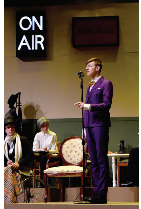
Byron Center Theatre's fall play was based on the classic holiday movie, It's a Wonderful Life, and staged as a live radio broadcast.

The play was based on the classic holiday movie with a clever twist thrown in: the story was staged as a live radio broadcast. The cast and crew welcomed more than 1,000 audience members across their three performances.