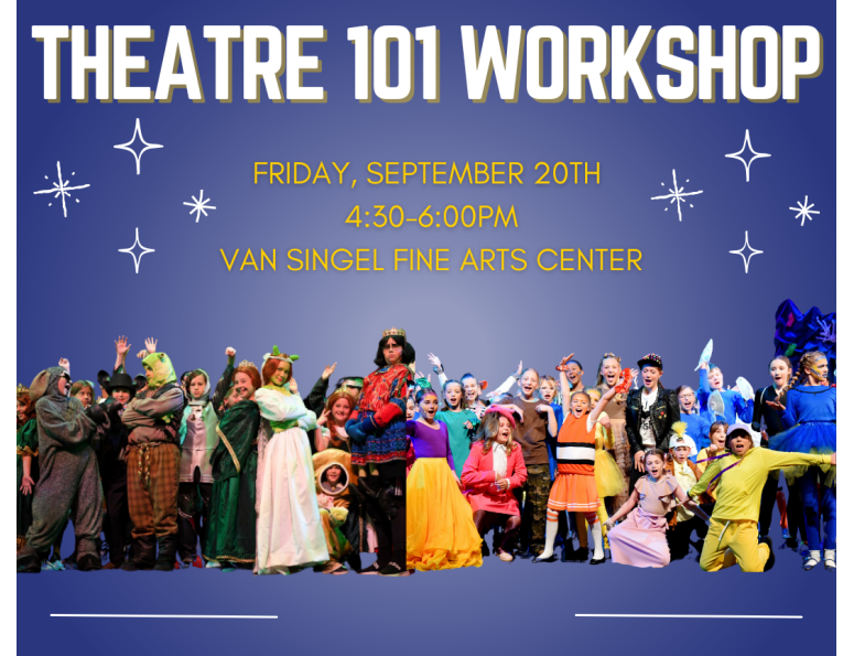
Open to 3rd - 8th Grade students REGISTER: vsfac.com/101