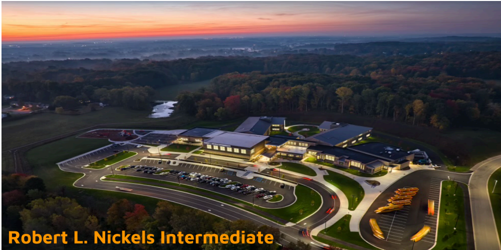
Robert L. Nickels Intermediate

Nickels Intermediate School Friday Office Communication January 10, 2025