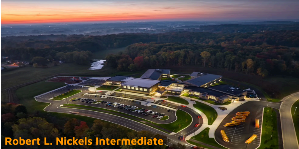
Robert L. Nickels Intermediate

Nickels Intermediate School Friday Office Communication January 16, 2026