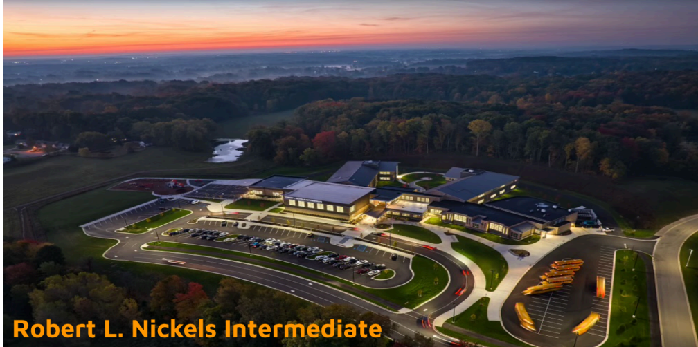
Robert L. Nickels Intermediate

Nickels Intermediate School Friday Office Communication January 2, 2026