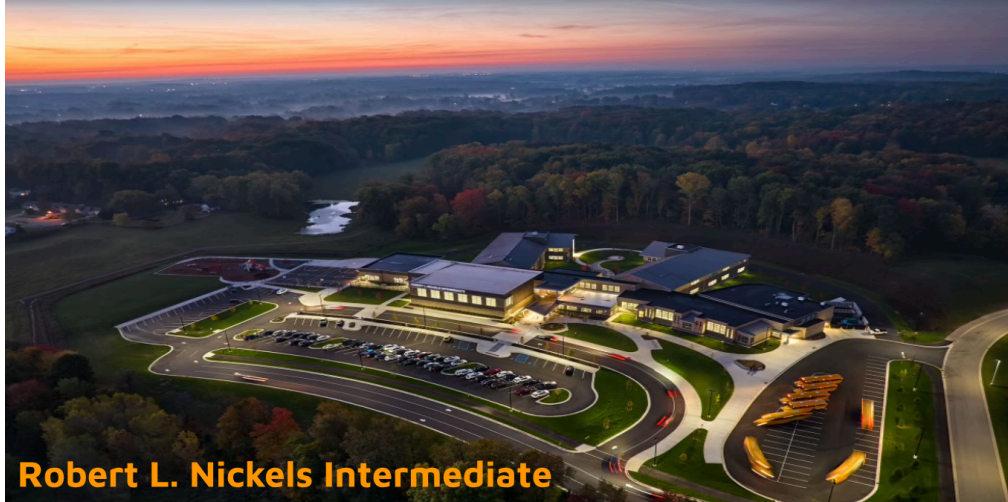
Robert L. Nickels Intermediate

Nickels Intermediate School Friday Office Communication January 9, 2026