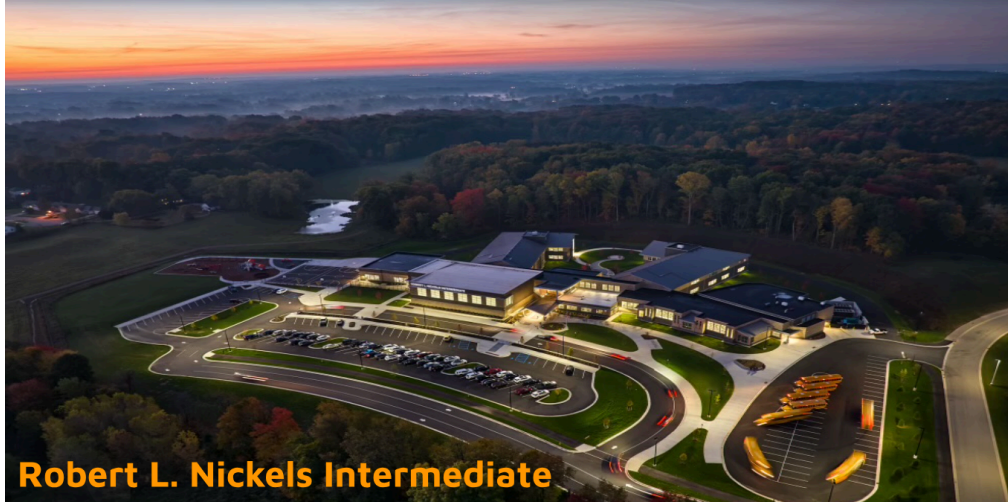
Robert L. Nickels Intermediate

Nickels Intermediate School Friday Office Communication September 5, 2025